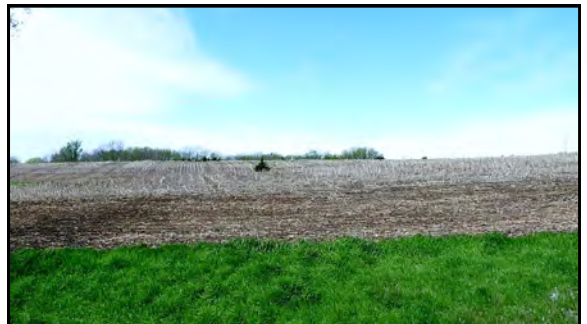
NO TREES OR GRASS ON SALE PROPERTY

Disclaimer: Information on the sale property has been gathered from sources deemed reliable, but Nebraska Land & Cattle Agency Inc. or agents thereof make no guarantees as to the accuracy. Buyers (or their agents) are expected to personally inspect the property, perform their own due diligence, and arrive at their own decisions as to purchase. Seller(s) reserve the right to refuse any or all offers submitted. All real estate agents not licensed with Nebraska Land & Cattle Agency Inc. shall be agents of the Buyer.