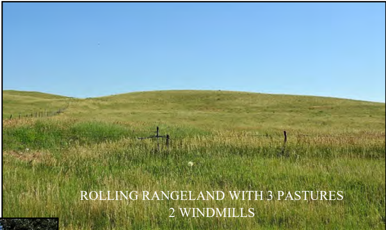
ROLLING RANGELAND WITH 3 PASTURES 2 WINDMILLS