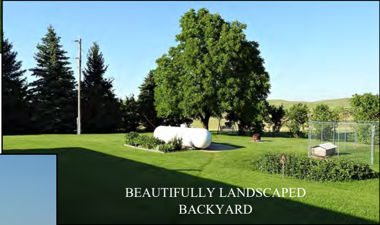
BEAUTIFULLY LANDSCAPED BACKYARD