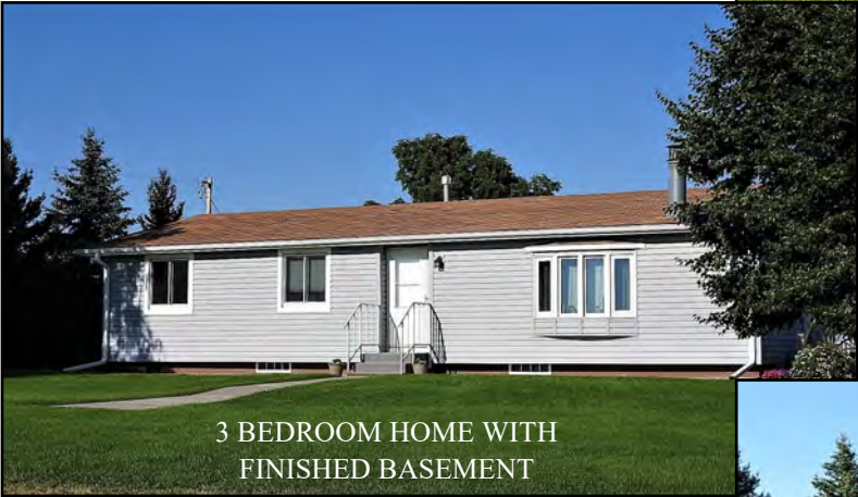
3 BEDROOM HOME WITH FINISHED BASEMENT